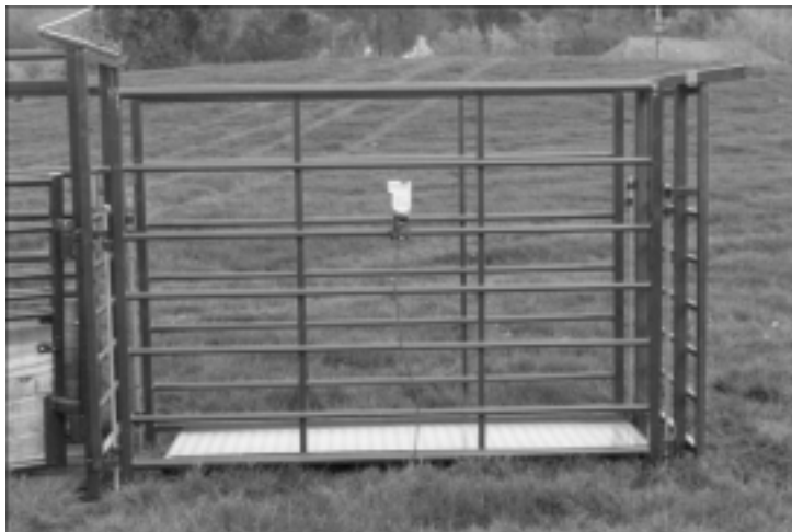
Weigher illustrated in cattle race.